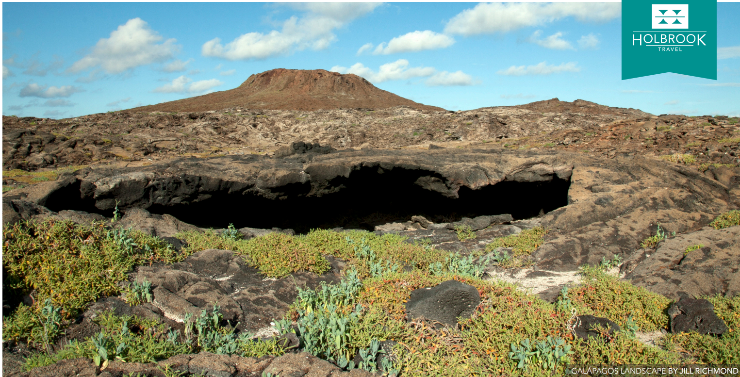
GALÁPAGOS LANDSCAPE BY JILL RICHMOND